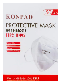
KN95 Masks SKU #2346116